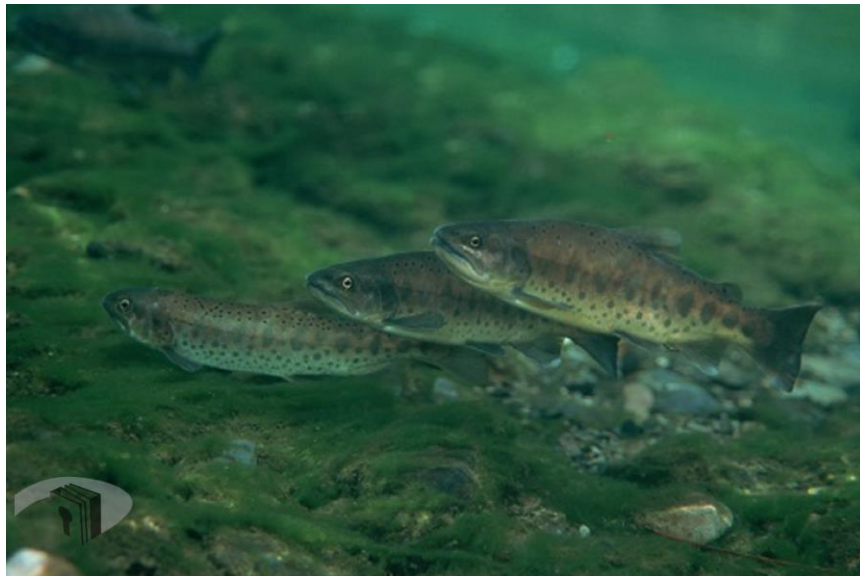
Figure 2: The national treasure fish in the Shei-Pa National Park, " Oncorhynchus masou formosanus "

Depository: National Archives Administration, National Development Council