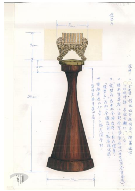
Figure 2: "Golden Melody Award" trophy design Folder title: The 1st Golden Melody Awards in 1989 ID number: AA25020000E/0078/0625/R00014 Transferring agency: Bureau of Audiovisual and Music Industry Development, MOC Depository: National Archives Administration, NDC