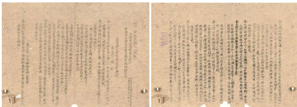
Figure 1: "Taiwan Provincial Public Market Management Rules" promulgated by the Taiwan Provincial Chief Executive's Office in March 1947.

Traditional markets in Taiwan were originally places where vendors gathered. During the Japanese colonial era, policies were made to establish public markets and new private markets were forbidden. After the WWII, Taiwan's urban planning followed these policies. In 1947, the Taiwan Provincial Chief Executive's Office promulgated the "Taiwan Provincial Public Market Management Rules." Privately funded markets were built and leased to vendors, doubling the number of traditional markets (Figure 1).